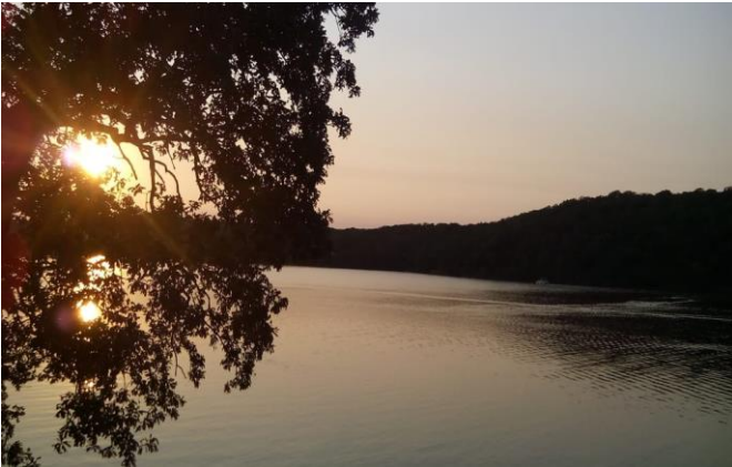
Sunset at PVL in Late September 2016