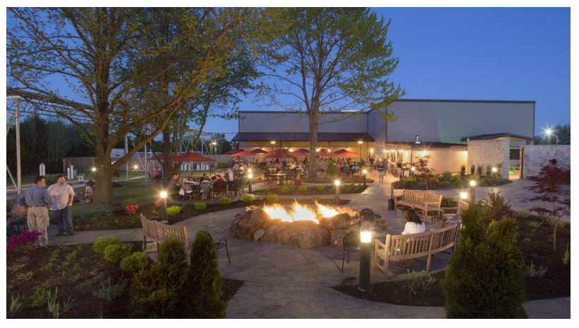
Twilight in the Gardens at St. James Winery

With the onset of fall and the grape harvest season upon us, we're planning a Sunday afternoon wine and cheese tour of Gasconade and Phelps County for Sunday, Sept 17<sup>th</sup>. Since we don't want to have a bunch of folks drinking and driving, we will rent a party bus from noon-5 PM. We leave from the lodge at Noon and will visit Cool Cow cheese near Owensville, then work our way to Wenwood Farms Winery for a tasting, then to the Gardens at St. James Winery/Public House Brewery. We'll stop there for wine and beer tasting and spend some time in the gardens, taking advantage of bocce,