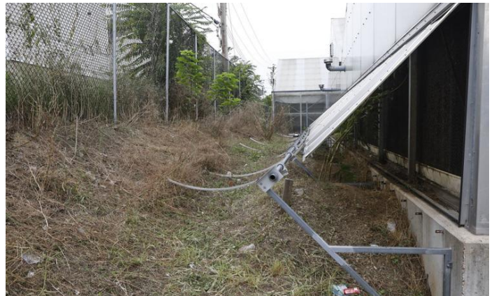
Before & After: Baisch & Skinner Flower Warehouse in St. Louis on Aug. 6 (left) and Aug 8 (right) 2019