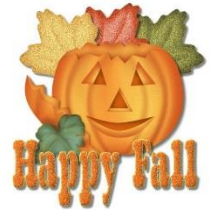
Begins 8:30 AM AM CDT Sept 22 nd

Visit our website at www.peacefulvalleylake.com September 2020