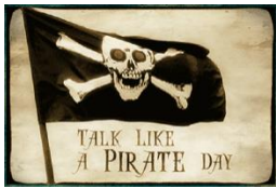
Talk Like a Pirate Day, Saturday, Sept 19