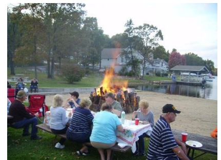
10 October 21, 2017--Members enjoying a picnic lunch shortly after the bonfire was lit.

It's October, and the days are getting shorter, trees are starting to show their fall colors, stores are stocking Halloween costumes and candy, and that means one thing-- it's time for our annual bonfire at the beach. This annual gathering usually draws one of the biggest crowds of the year. As in previous years, Peaceful Valley will be providing burgers, hot dogs, and fixin's, along with paper goods and water and soft drinks. The rest is pot luck, so please bring something to share and your own adult beverages. We'll have picnic tables moved to the beach, but you may also want to bring a folding chair. So, mark your calendar, and we'll see you there!!