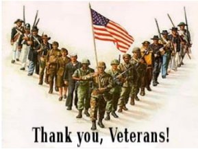
Thank you, Veterans!