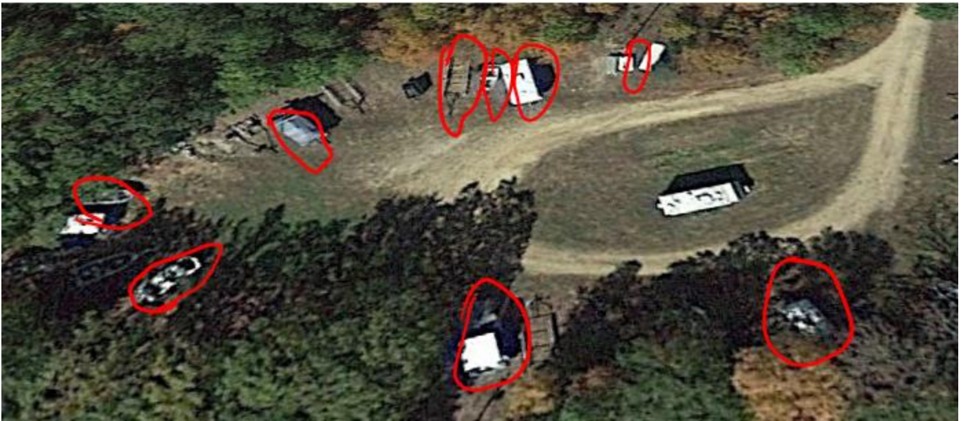
October 2014 (from Google Earth)