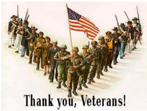
Thank you, Veterans!