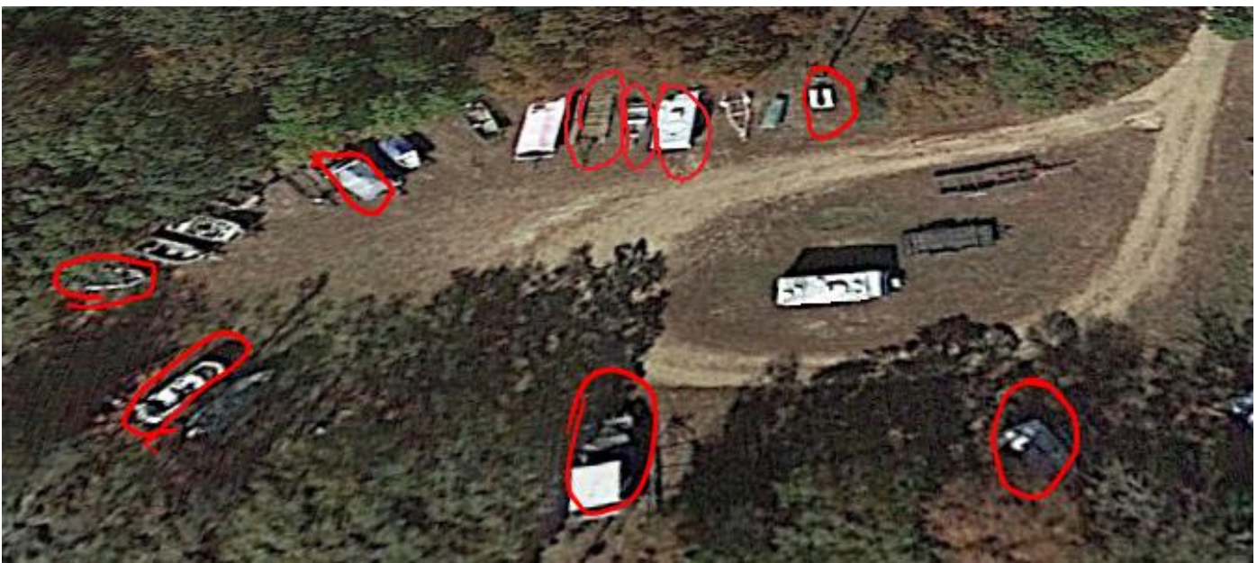
November 2016

Our goal is to eliminate the abandoned junk that's taking up space so we can free it up for active members. About 2/3rds of the items have membership numbers on them, but given the age of some of the items, we're not sure these things belong to the current owners with those numbers. Over the next several weeks we're going to contact members about the items with their membership number affixed to verify that (1) it's their property and (2) they wish to keep it in the lot. What we've found in the past is that some members have either forgotten that the item was there and no longer want it, or that it's a previous owner's property and they had no idea it was there.