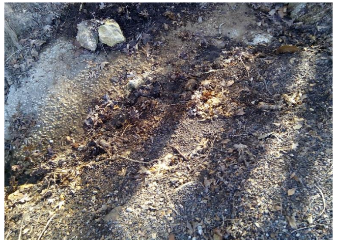
After--bottom of the ditch visible.