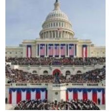
Inauguration Day Jan 20th

Visit our website at www.peacefulvalleylake.com