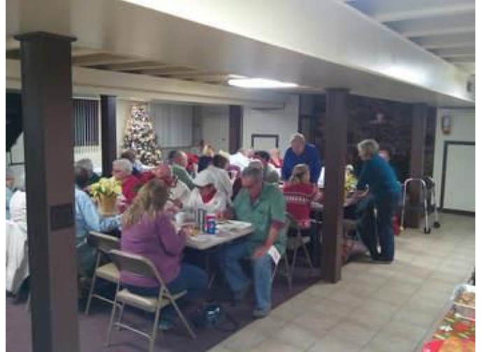
2016 Holiday Pot Luck

Well, Thanksgiving has come and gone, and now it's time to ramp up for the holiday season with decorations, power shopping, cooking, and baking, and some great family time. Come share some of that holiday spirit with your friends and neighbors at our annual holiday pot luck dinner at the Peaceful Valley Lake Lodge. If it's anything like last year's event, it will be one of our most popular events. We know many of you will be having traditional holiday fare for your holiday with your families, so we wanted to do something a bit different--we're going with an Italian food theme for this event. Peaceful Valley will be providing lasagna, a pasta dish with sauce, garden salad, and garlic bread, along with plates, utensils, etc., but we ask that you bring something to share. Come join us for a delicious